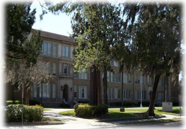
School Demographics 2020-2021 Total Enrolled Students: 1,653

Riverside High School was impacted by COVID-19, as many schools were, starting Spring 2020. Students experienced school building closure and the shift to live online instruction March-August 2020. In-person instruction is currently back in place at Riverside, but we are prepared to shift to online instruction if needed. Our curriculum was impacted by the shift in instruction formats. We were not able to provide as many Advanced Placement and dual enrollment classes during the 2020-2021 and 2021-2022 school years. The State Reading Assessment graduation requirement was waived for the Classes of 2020 and 2021. Students also had limited opportunities to participate in community service projects during the 2019-2020 school year.